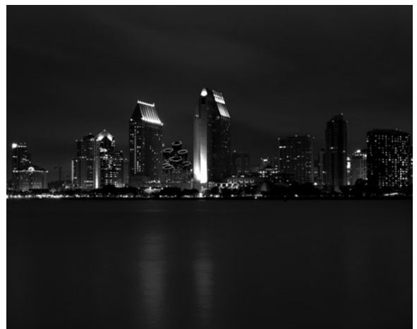
“Gotham” © Skip Morrow

For the B&W category, I had a wonderful picture of the San Diego skyline. B&W photography at night can be really challenging, getting the contrast to look good. For this one, I pushed the exposure down a lot in Camera Raw, and boosted the contrast a lot. This was 44 seconds at f16 (ISO 100).